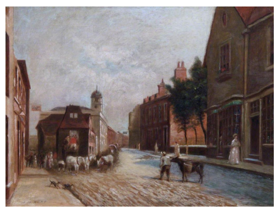
4. Old Palace Road / Church Street