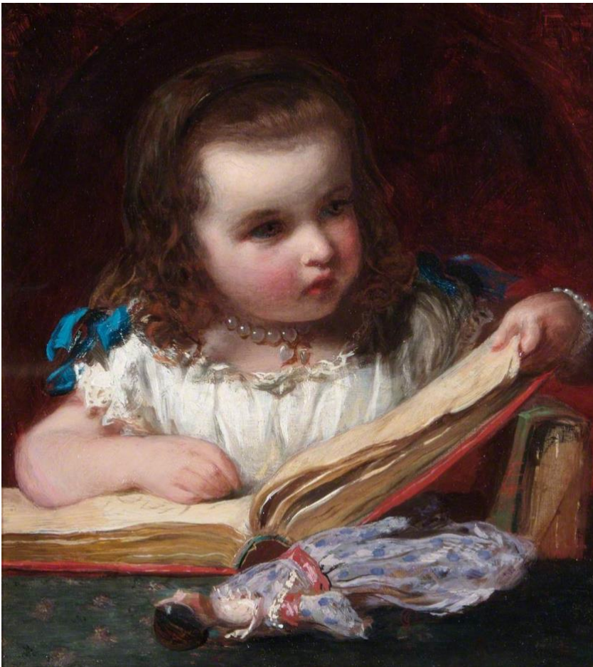
A Girl Reading James Sant