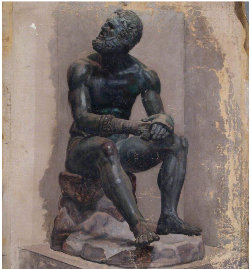
The Terme Boxer Unknown Artist