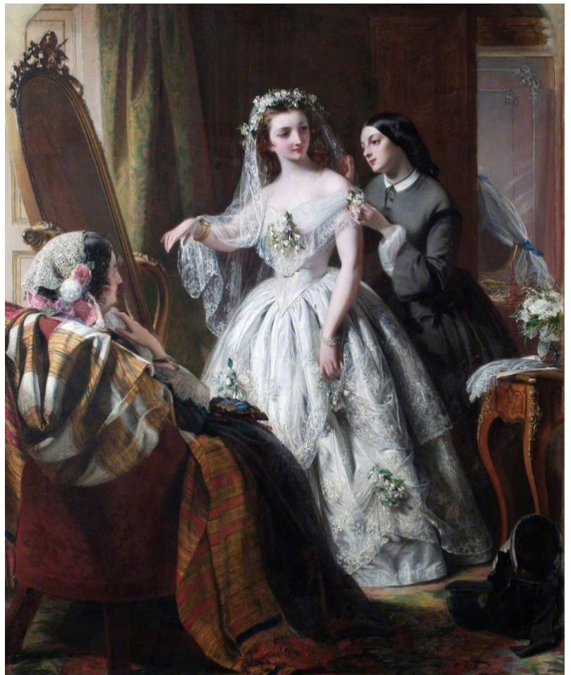
The Bride Abraham Solomon 1856